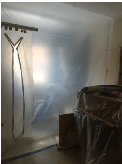
Graham Suite Kitchen sealed off