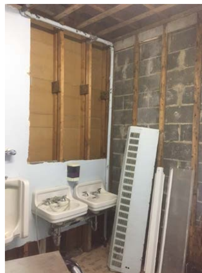
First floor men's bathroom